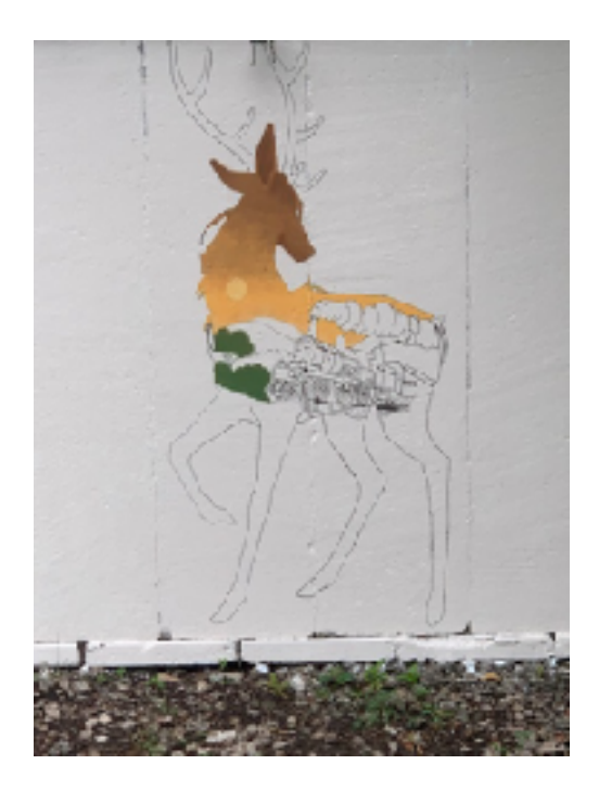
Signal bungalow mural in progress (August 12, 2021)