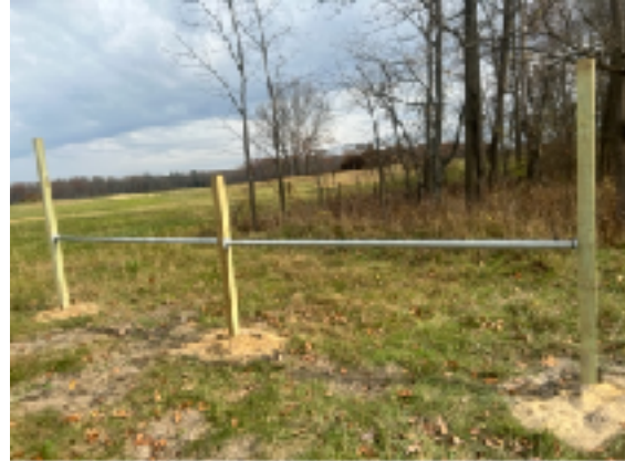
Above Horse hitching rack shown installed on November 4.