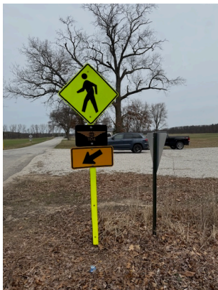
High profile pedestrian crossing sign at parking lot facing north (March 2025)

for approval by Highway Superintendent, Rachel Oesterreich—two serving northbound traffic and one southbound. Another result was to recommend placement of high profile pedestrian crossing signs and “piano key” markings on SCR 700 E between the trailhead and the new parking lot. As a courtesy the Department placed new pedestrian crossing signs.