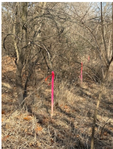
Centerline stakes within the northern 1/3 of the northwest extension mark the path for tree cutting.

PTC members and other interested persons appeared in the North Judson Town Hall on February 20 to consider contract bids for the planned one-mile northwest extension of